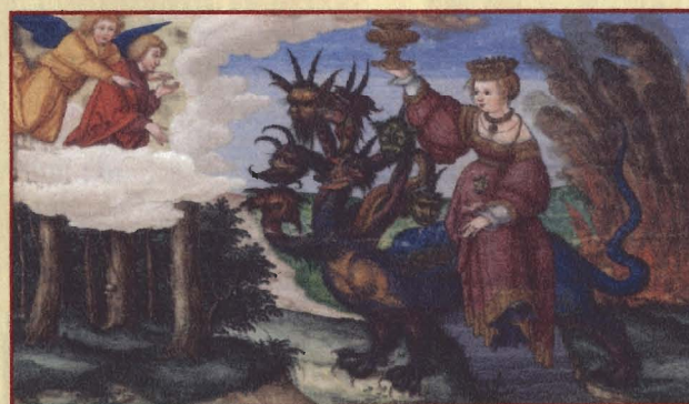
MYSTERY, BABYLON THE GREAT, THE MOTHER OF HARLOTS AND ABOMINATIONS OF THE EARTH.